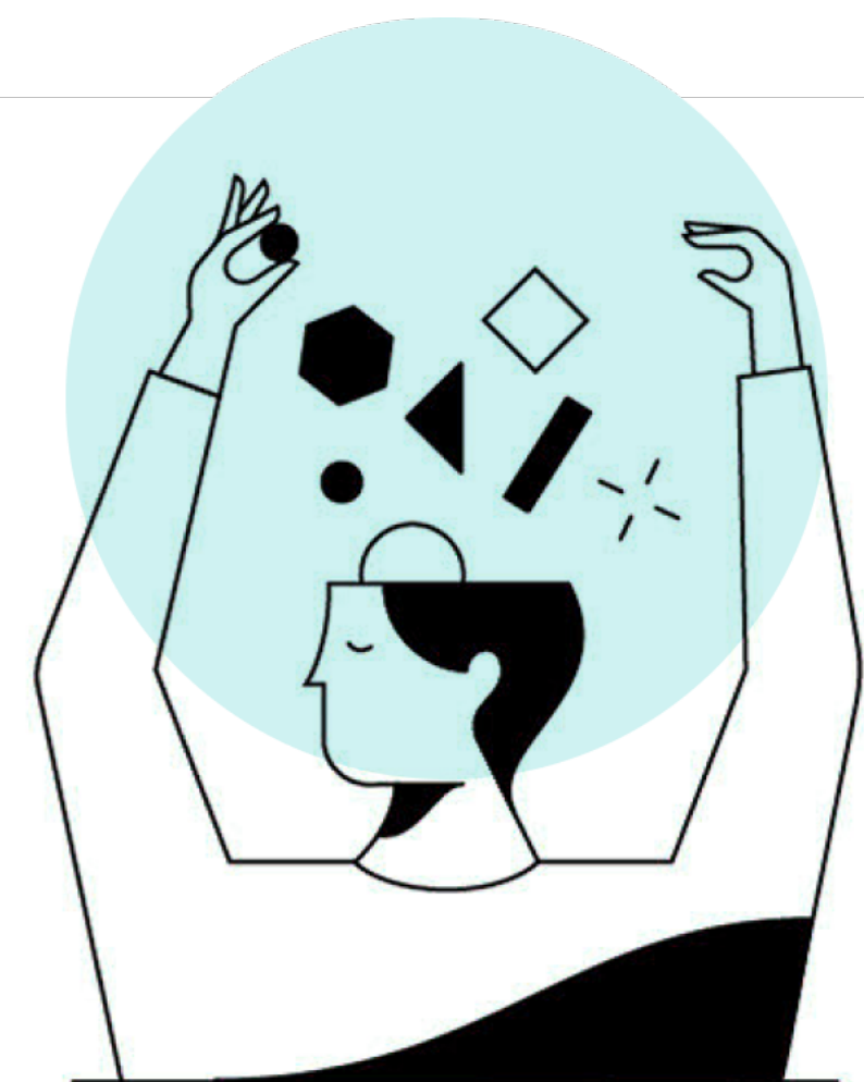
this image represents you by the way...

Have you noticed the positive impact this program has already had on your relationship with your work colleagues, partner, spouse, and your family?